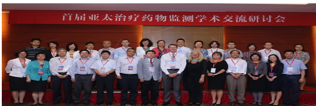
Fig. 3 The Chinese Society of TDM attach importance to academic communication with international experts

At present, TDM in China has formed a pharmacy, clinical, test co-participation, multi-disciplinary integration model for organ transplantation, anti-infection, epilepsy, asthma, cardiovascular disease and other diseases therapy provide a scientific means of individual treatment.