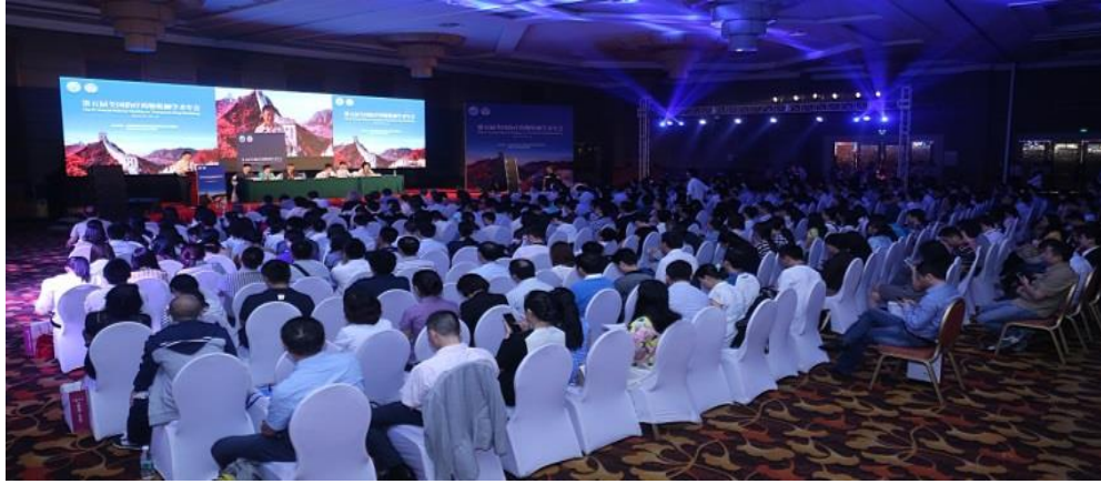
Fig. 4 National annual academic conference held by The Chinese Society of TDM